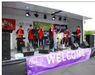
13 Different Venues

$2,500—TITLE $1,000—PRESENTING $500—CORE $250—STAGE