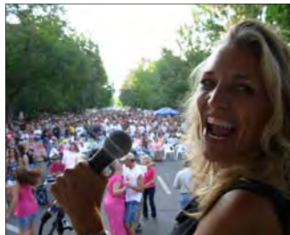
Fantastic Media Partners, Gracious Hosts, Awesome Crowds, Wonderful Food, & Great Bands!